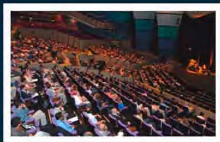
Plenary session at the Spring Meeting 2006

Throughout the 1990s and more recently E-MRS has broadened its range of activities and enhanced its sphere of influence at European and World level. An overview of some of issues in which the society is involved can be seen in the following pages.