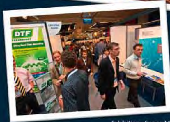
Exhibition - Spring Meeting 2011