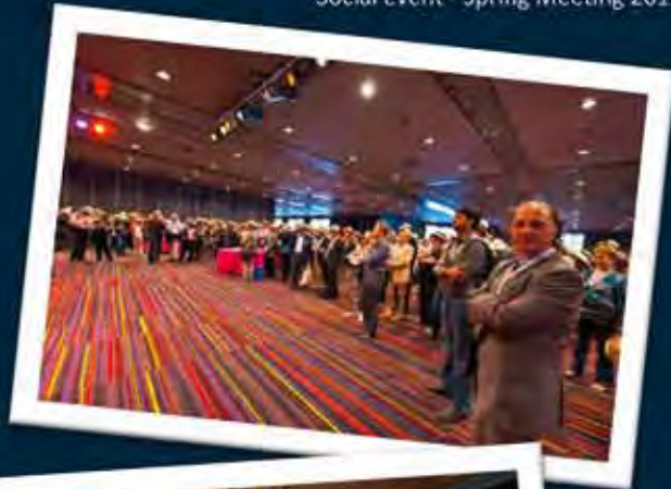
Social event - Spring Meeting 2011